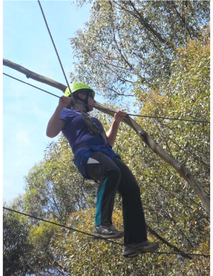
High ropes activity

information on CREATE's activities and programs and then answered questions related to their foster care experiences. All were incredible and the new foster carers provided lots of positive feedback. They were very touched by what the young people said, it gave them a real insight into what foster care is all about.