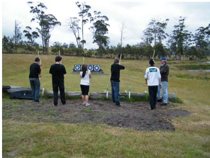
Create Your Future activity